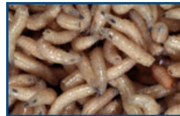
The Natural History Museum Maggots of the bluebottle blowfly Calliphora .

Forensic entomology is the interpretation of entomological evidence to help resolve a criminal investigation. Recently, the level of awareness of forensic entomology within the entomological community, especially in the United States, has increased. The insects that have been most extensively studied in relation to their forensic uses are the blowflies--members of the Calliphoridae fly family--in particular their larvae or maggots, because: They are the insects most commonly associated with corpses. They colonise the body most rapidly after death and in greater numbers than most other insect groups. They usually provide the most accurate information regarding the post-mortem interval--the time that has elapsed since death, a major objective in forensic entomology.