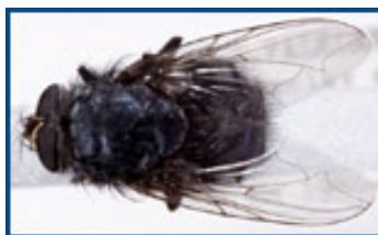
Adult bluebottle blowfly, Calliphora vicina.