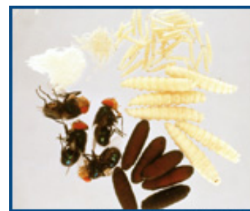
The Natural History Museum Life cycle of a typical blowfly.

Blowflies have four life stages--egg, larva (maggot), pupa and adult. The larval stage is divided into three instars and between each instar the larva sheds its cuticle (skin) to allow for growth in the next instar. The pupa is a transition stage between larva and adult. It is found inside a barrel-shaped puparium, which is actually the hardened and darkened skin of the final instar larva. The immature stages of blowflies are poorly documented in comparison to the adults.